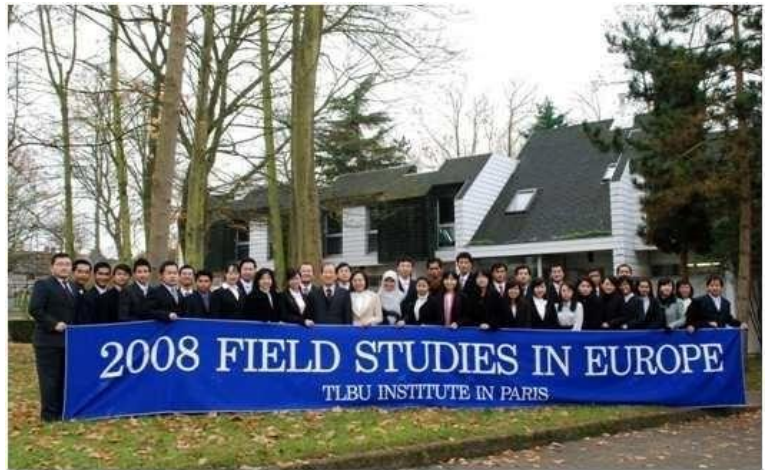
In front of TLBU Institute in Paris

organizations operated through visiting EU Commission, World Trade Organization (WTO), World Intellectual Property Organization (WIPO), International Labor Organization (ILO), and International Court of Justice (ICJ) and attending instructive lectures on specific issues given by experts from respective organizations. By studying European model, the students got encouragement and inspiration to develop their individual countries and strengthen cooperation in East-Asia.