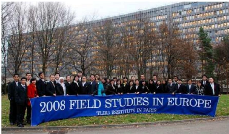
Visiting International Labor Organization