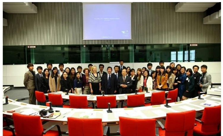
In the conference of European Council - Brussels