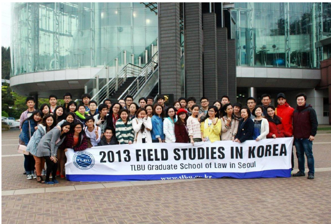
Museum of POSCO History