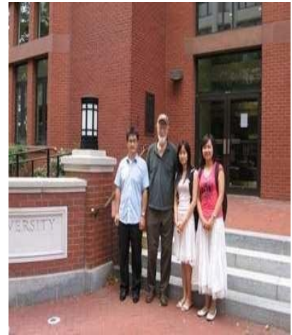
TLBU Doctoral Students in USA

TLBU is a unique educational organization composed of the TLBU Graduate School in Seoul, TLBU Institute in Paris and the TLBU Law School in Maryland (under preparation), USA. Qualified students at TLBU Graduate School of Law in Seoul upon graduation will be eligible for further study sponsored by TLBU Foundation either in United States, where they will embark upon in-depth studies on US Laws or in France. Up to date, 15 students have been sent to US to pursue further study. In the near future, the TLBU Campus (in Maryland) in contemplation is going to offer LL.M. program of one qualified law school and New York Bar Examination within TLBU Master of Laws Degree program.