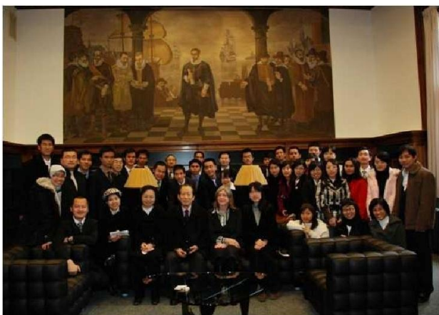
Being welcomed by staff at the International Court of Justice (ICJ) located in Hague