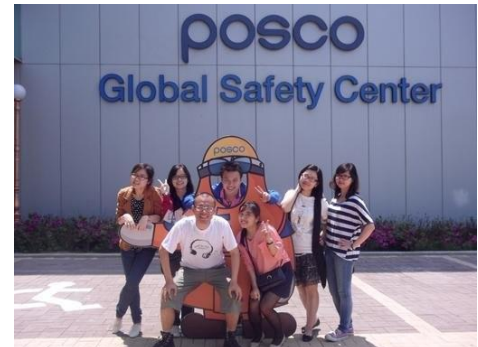
Global Safety Center, POSCO

“Live to experience, to observe”, TLBU Graduate School of Law brings all first year students to participate in Field Studies in Korea which is a special annual program. Students have chance to visit Korea's largest steel maker POSCO in Pohang City. With the slogan "Resources are limited, creativity is unlimited" and the fabulous video presented itself, POSCO lets visitors have a better understanding of its history and development.