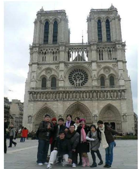
Visiting the Notre Dame de Paris in France