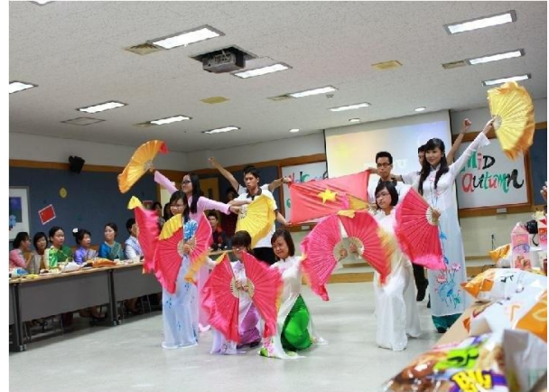
A performance in welcoming party

In TLBU, students shall have unforgettable birthday parties with Presidents and all friends. The school shall hold a birthday parties for each student that make them feel warm and to be at home. In addition to the official parties, there is usually a small noodle party among students to cheer up and celebrate the birthday.