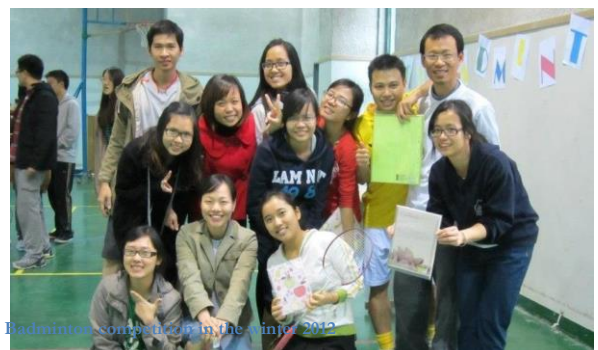
Badminton competition in the winter 2012

Sports are one of the most favorable of TLBU students. The school encourages students to take part in several these outdoor and indoor activities. There will be some sport competitions for them to show their talent and enjoy the fun.