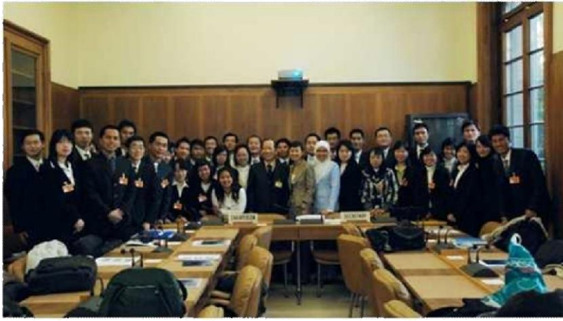
Being given lecture on WTO Dispute Settlement at WTO headquarter in Geneva, Switzerland