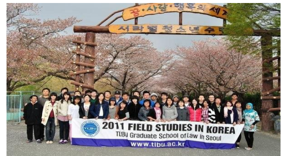
Gyeongju Bomun Tour Complex

Meanwhile, TLBU Graduate Students also visit Gyeongju Bomun Tour Complex with wonderful scenery. In this side, students widely overlook the typical culture and atmosphere of Gyeongju City. Field Studies in Korea is a precious occasion which broadens students' horizon, enriches their life and strengthens their friendship.