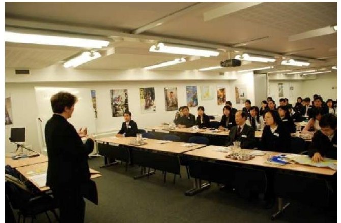
Attending presentation on EU development presented by EU staff in Brussels, Belgium