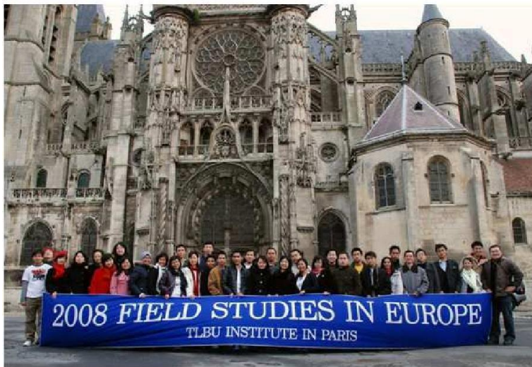
Taking picture during the picnic to the Palace of Fontainebleau