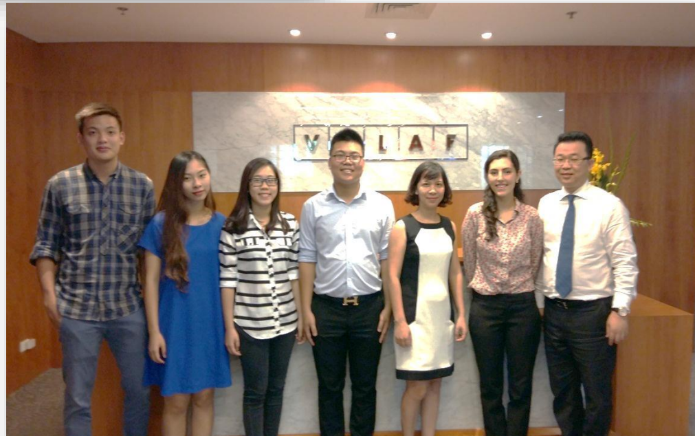
VILAF Interns 2015