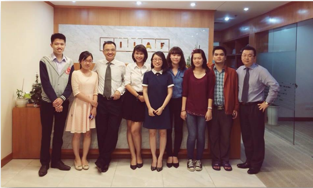
VILAF Interns 2014