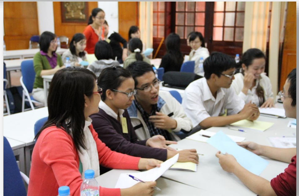
Working in groups